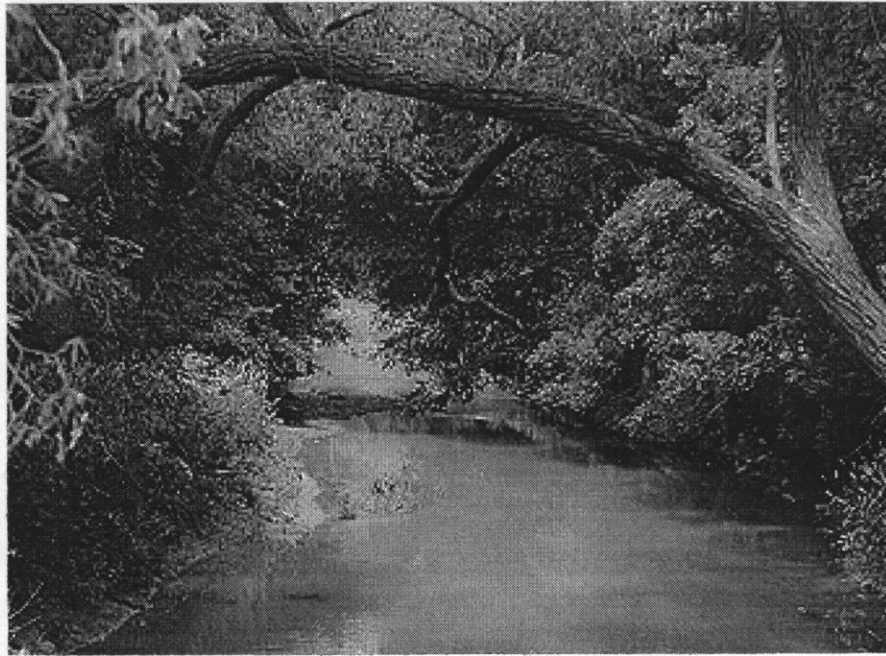
Site of the Benjamin Burgess saw mill in 1836 at Somers, WI

In January, 1994, I received a letter from a