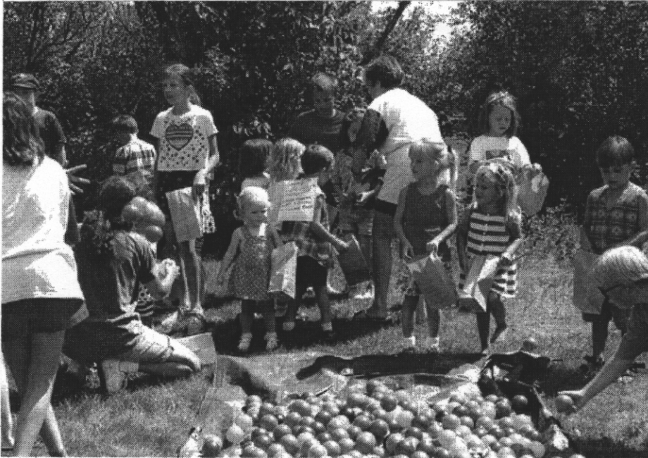
Fun and games at a past picnic