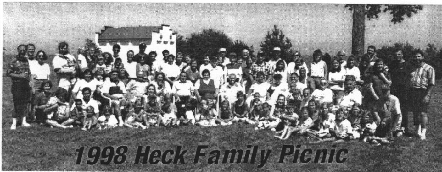
1998 Heck Family Picnic