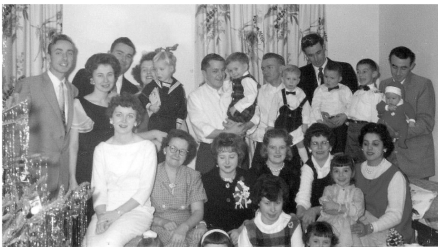
One Heck of a lot of family members. Photo taken at Christmas, 1962. (We should save this picture for the 2019 Heck Family Picnic and see who can identify the most people in it.)

Pictures at right show the two posters that we displayed at the Heck Family Picnic in 2018 and 2017. We also had a computer set up to show home movies taken in the 1940s.